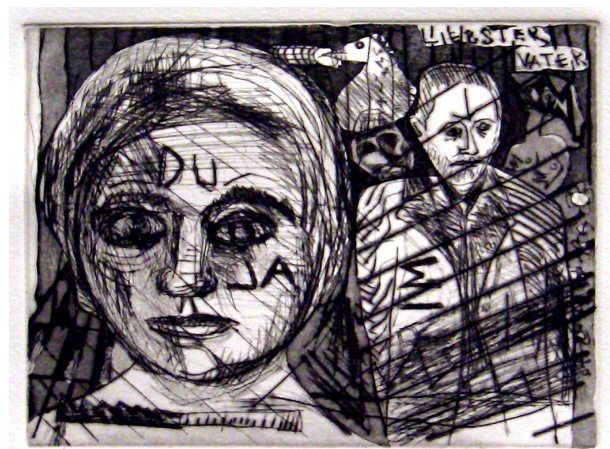
Casa Kafka – Lorenzo Bruschini (incisione calcografica)