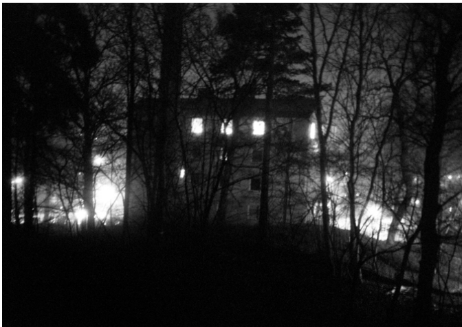
Intimate North – Joakim Kocjancic (install. fotografica – part.)