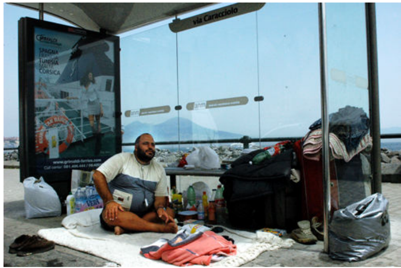
Summertime residence – Lorenzo Pari (photo)