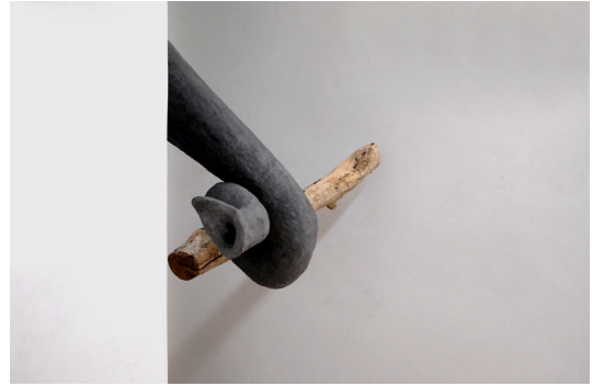
the Memory of Casa Africa - Rondini/Tourè/Pallini (installation – part.)

The exhibition will be previously presented in the gallery of the "Atelier La Lucciola" in Palermo, between the 25 th of august and the 1 st of september 2007. The inaugural event in Rome is organized for the "Notte Bianca", the night of the 8 th of september 2007. During that night artistic performances, meetings, and live music will take place on the subject of home as a shelter.