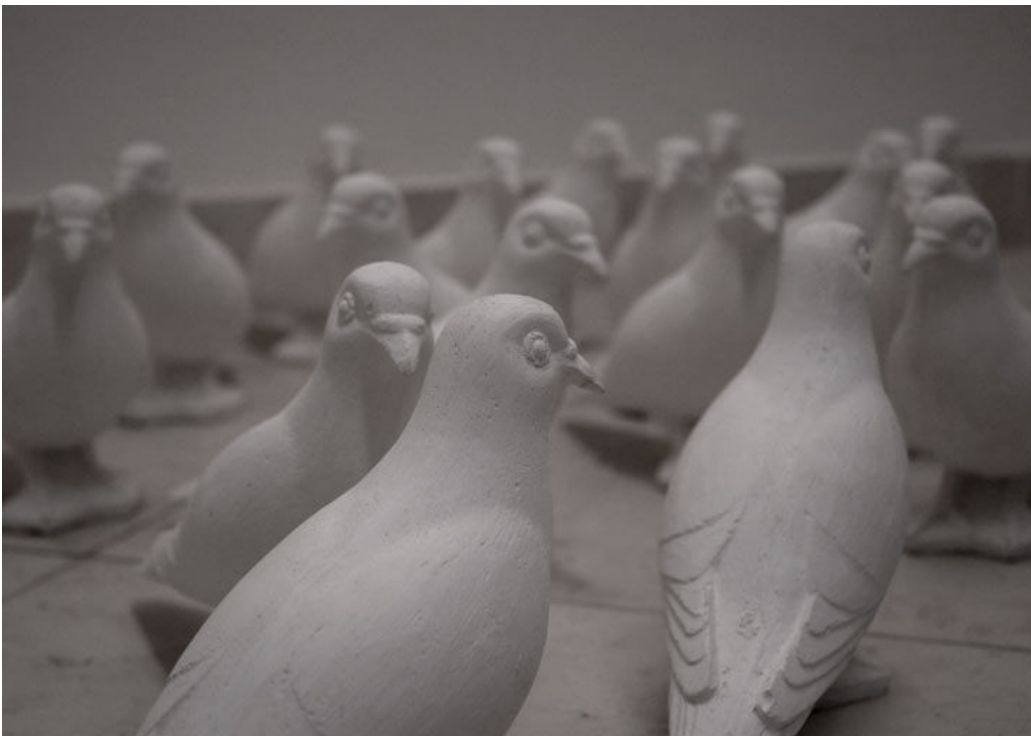
One dove a day – Yo Akao (installation)