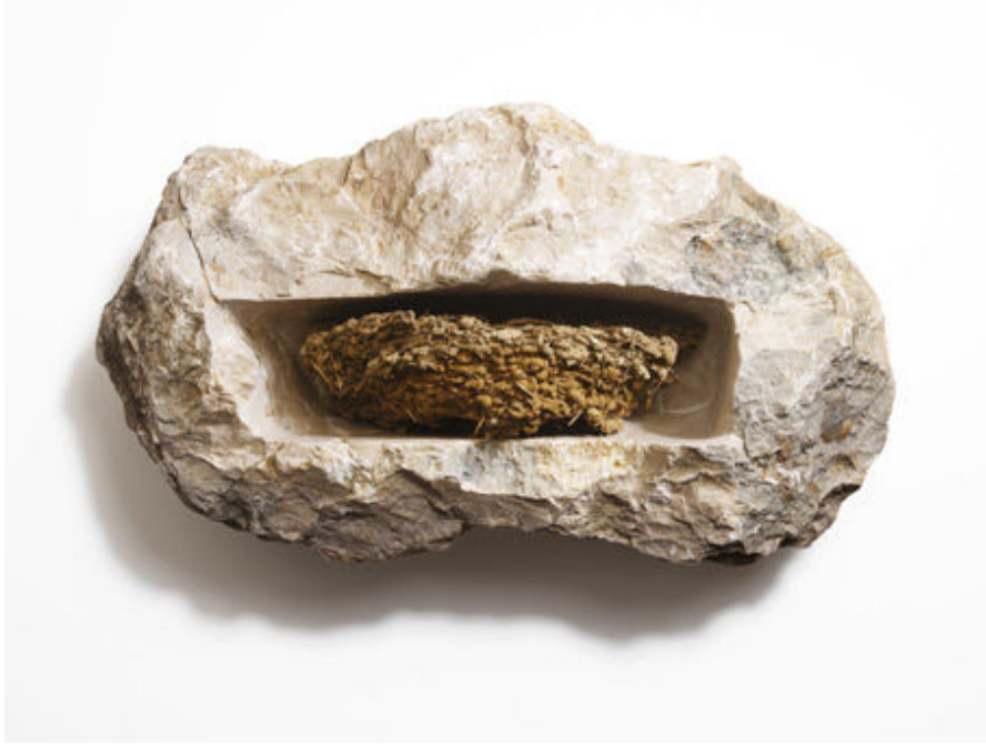
Shelter from the storm 1 and 2 – Giacomo Tringali (sculptures)