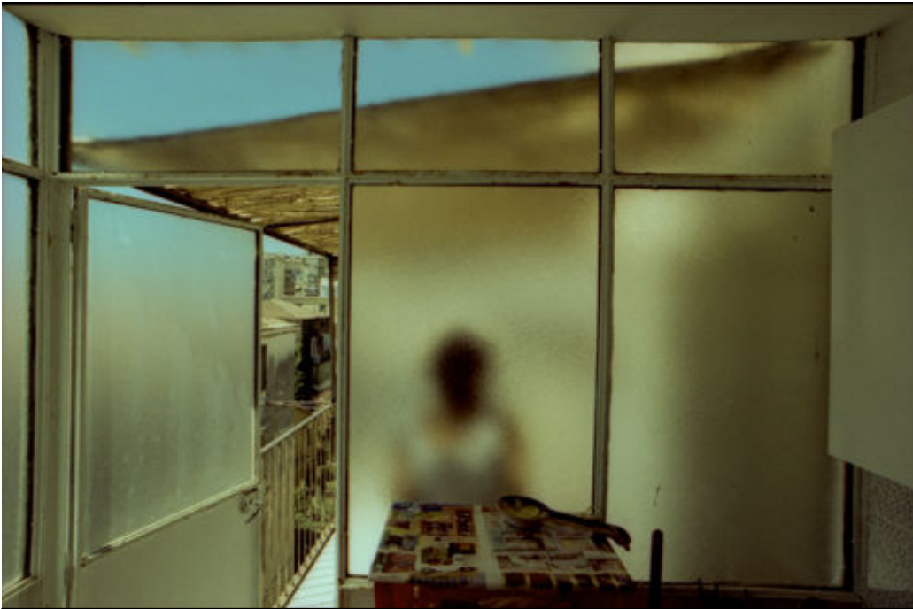
Apartment 17