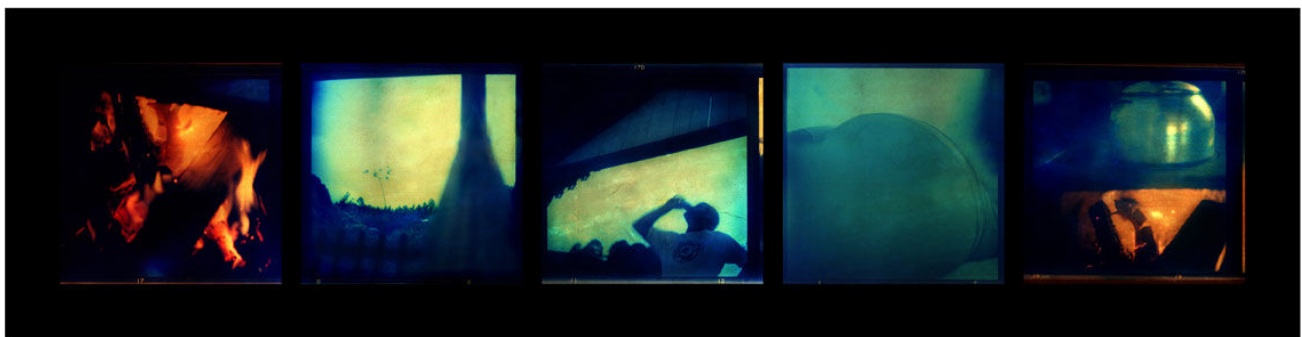
Caxixe (para W. Klein) - Bruno Zorzal (photo)