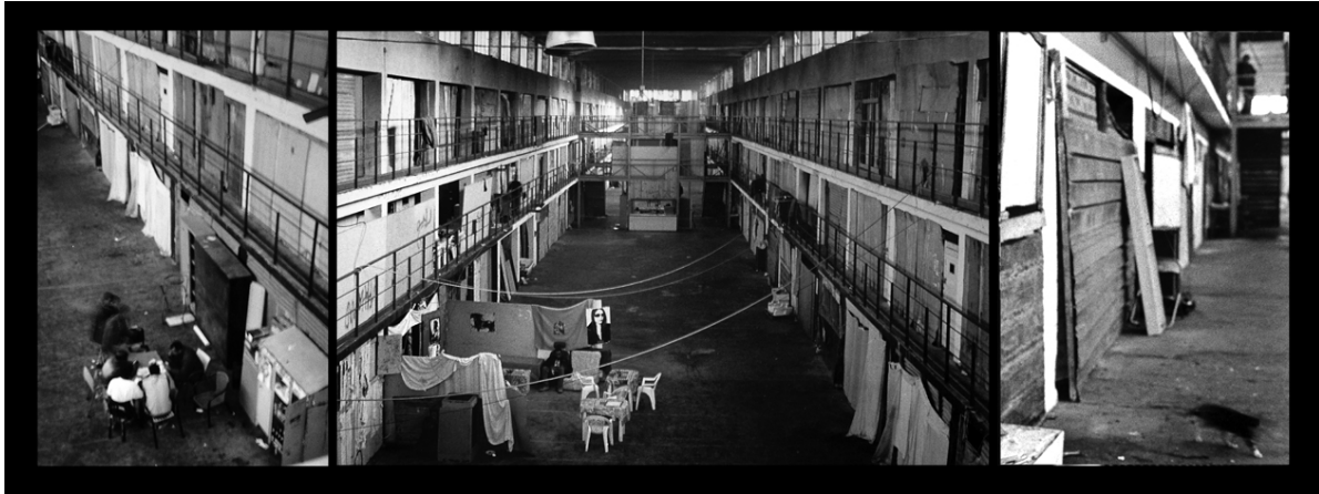
Political exile – Lorenzo Pari (photo)